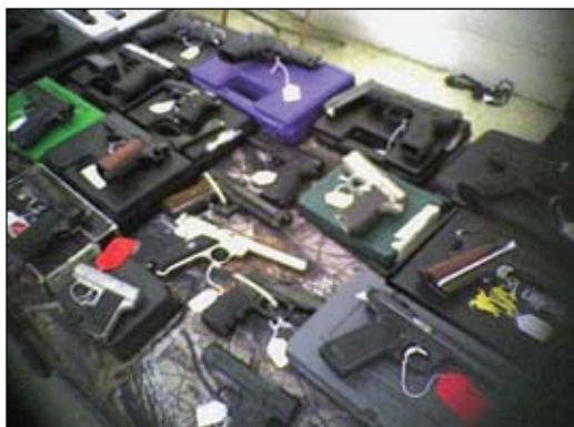
One of four tables from private sellers in Smyrna, TN

It is illegal to “engage in the business” of selling firearms without obtaining a federal firearms license and conducting background checks on buyers. Courts have considered several indicia – selling numerous guns, selling guns regularly, and selling firearms for profit, among others – to determine whether defendants are unlawfully “engaged in the business” and not selling occasionally from a personal firearms collection. Investigators observed many private sellers doing brisk business at gun shows.