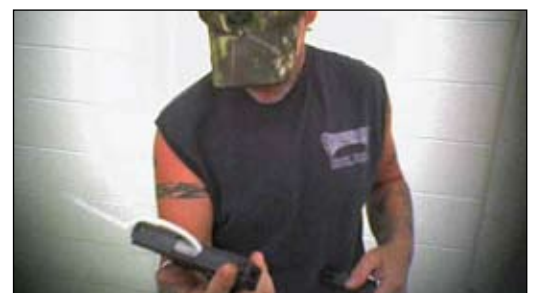
Private seller in Smyrna, TN who explained that he works for another private seller

Sharonville, OH: A private seller told our investigator that “he worked for another guy” who customized the guns for sale. He also said “he’s the dealer...I just work for him.”