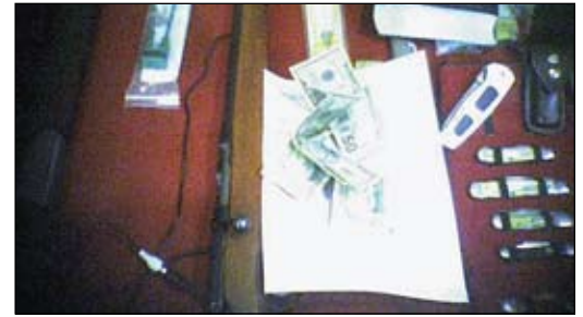
Assault rifle being bought in Sharonville, OH

Smyrna, TN: When an investigator tried to negotiate down the price of a gun, the private seller responded, “I can do a little dealing, but I’ve got to watch. I don’t know what [my partner’s] got in it.”