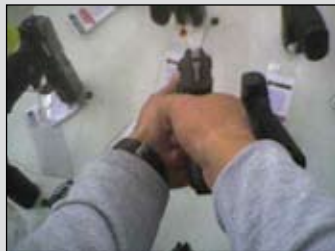
Male Investigator tries two different handguns.

MI: I like this... but I like the feel of this better. You know, it's a little lighter in my hand. MD1: It's more of a compact gun MI: Right MD1: For carry. MI: OK MD1: Taurus is a good gun. They shoot really well. MI: [Inaudible] Taurus. MD1: You want it? MI: Yup. Sure do. MD1: Alright. Come on down here to my table. MI: Baby? Where's my girl? Oh, there she is.