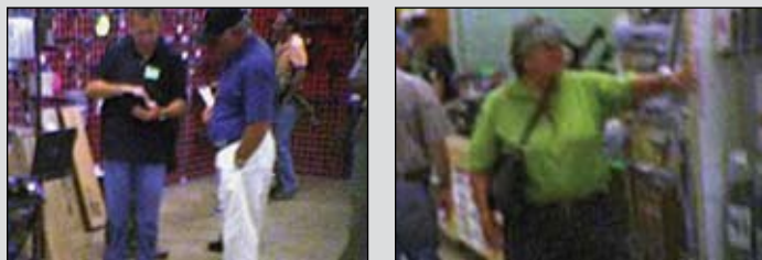
Left: Male Dealer in blue jeans and black shirt talks to Male Investigator in white pants and black hat.