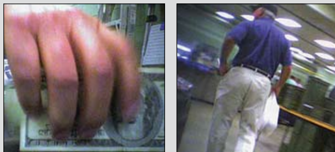
Left: Male Investigators handing over money.