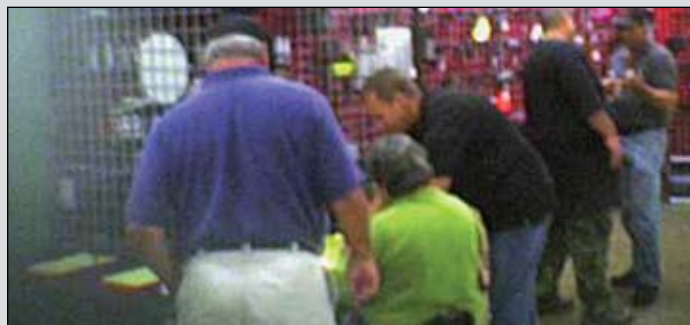
Left to Right: Male Investigator, Female Investigator, and Male Dealer.

MI: Alright. Yeah, I'm going to...My friend over here's to do some paperwork for me.