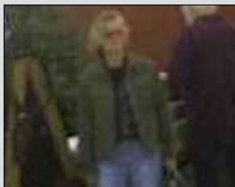
Left: Male Dealer #1 talks to Male Investigator (not pictured). Right: Female Investigator inspects a separate vendor.

MALE DEALER #1 (MD1): How's it going? MALE INVESTIGATOR (MI): Good. How about yourself? MD1: Oh, pretty good. Can I help you? MI: Well. I'm looking at...maybe at this Ruger here. Pretty nice. MD1: Oh yeah. They're real sweet guns....Got any questions? MI: Uh.. this is uh...15 rounds, right? MD1: Yes.