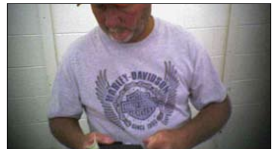
Private seller selling gun he “just bought” in Smyrna, TN

Smyrna, TN (pictured): A private seller was offering a handgun for sale that he had “just bought.” When the investigator said, “Oh, so you’re turning them then today, huh?” the seller responded “I hope to turn one.”