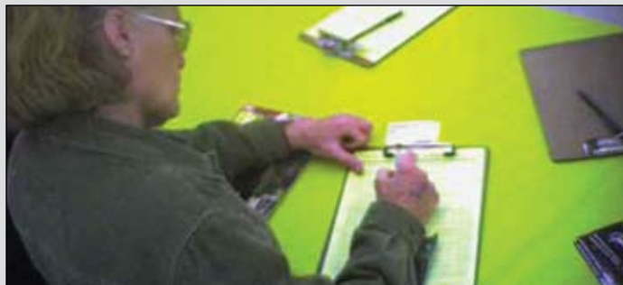
Female Investigator receives 4473 Form.

FEMALE DEALER (FD): How you doing? FEMALE INVESTIGATOR (FI): Good FD: I just need you to just fill out the front of that form. FI: All righty. FD: Thanks [...] FD: Is that the right price? MI: Uh.. I thought it was $369. In fact, I'm sure it was.