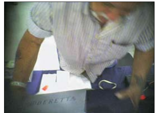
New-in-the-box Beretta sold in Niles, OH

Reno, NV: A private seller said that he was firm on the price of the gun because “it’s brand new.”