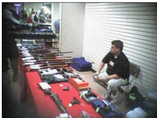
Two of five tables, from long gun seller in Columbus, OH.

Columbus, OH (pictured): A private seller explained that he keeps a lot of long guns in stock because he “does a lot of shows out of state” and can’t sell handguns out of state.