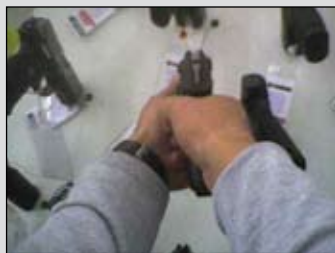
Male Investigator tries two different handguns.

MI: I like this... but I like the feel of this better. You know, it's a little lighter in my hand. MD1: It's more of a compact gun MI: Right MD1: For carry. MI: OK MD1: Taurus is a good gun. They shoot really well. MI: [Inaudible] Taurus. MD1: You want it? MI: Yup. Sure do. MD1: Alright. Come on down here to my table. MI: Baby? Where's my girl? Oh, there she is.