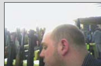
Left: Male Dealer #2 questions Male Investigator. Right: Male Dealer #2 instructs Female Dealer to stop the sale.

MALE DEALER #2 (MD2): Who's buying what? I: [Inaudible] MD2: OK. Can you own a gun buddy? MI: Absolutely MD2: OK. Do you have a problem filling out a form? [...] MI: Alright, Yeah, no. I can't. I'm, I'm...It's not going to be my gun so I won't fill out the form. MD2: Well we won't put anything in your name. We just want to make sure you're a good guy. MI: What form am I going to fill out then? MD2: Same one she did. MI: No, Well, I, I'm not going to do that, 'cause the gun's not for me. MD2: Void it, baby.