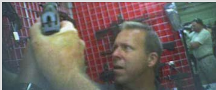
Left to Right: Male Investigator tests a gun and Male Dealer reaches for a second gun.